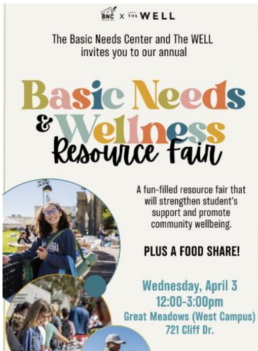
Promise Registration Rally

This week, we invite you to visit the Food Pantry to pick up free groceries in ECC-14. Ensuring access to nutritious food is essential, and we're here to support you in every possible way! We encourage you to bring a reusable bag as we are trying to reduce our carbon footprint and not use plastic bags.